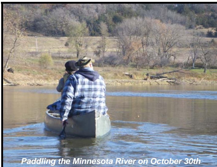
Paddling the Minnesota River on October 30th

The Minnesota River Watershed Alliance (Watershed Alliance) is a Volunteer, Active, Action-Oriented Group of Watershed Advocates. Participation is open to Every Citizen, Landowner, Organization and Agency in the Minnesota River Watershed.